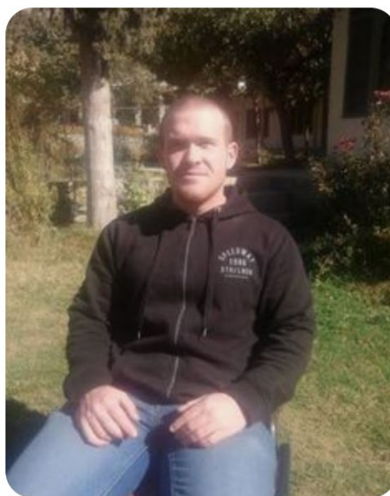
Cute People Men Christchurch >