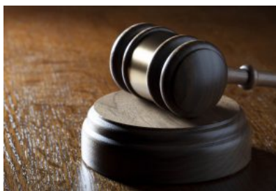
Gavel on wood table

f It is a fundamental principle that the judicial component of government is independent in order to insulate its members from punitive actions by the legislative and executive branches of the government. Only when the judiciary is independent can it make fair decisions that uphold the rule of law, an essential element of any genuine constitutional democracy.